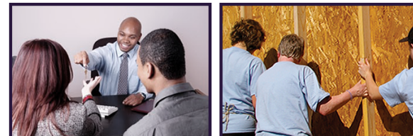
Top three

Prisoner Reentry Affects Us All It's Time to Stop The Revolving Door